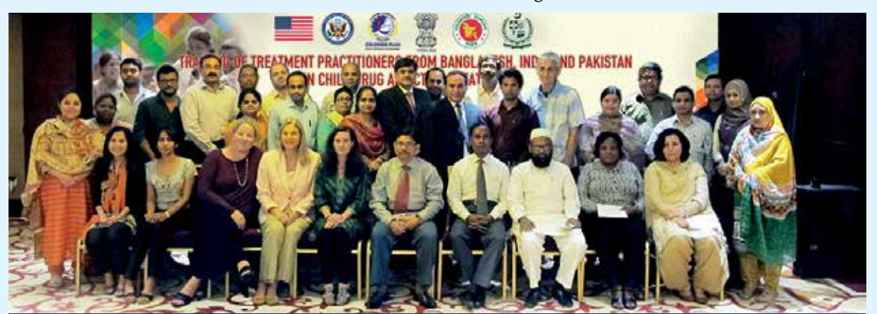
Training participants with the officials of the Bangladeshi Department of Narcotics Control and the Colombo Plan

Ten treatment practitioners from India, Pakistan and Bangladesh along with the six Master Trainers were selected to participate in the Child Substance Use Disorder Treatment training.