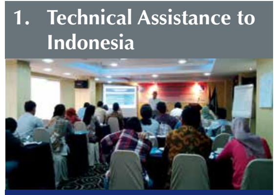
Treatment practitioners participating in the training programme designed for the Batam province, Indonesia.