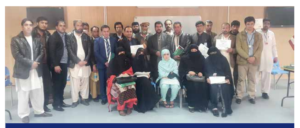
Participants of the first National training programme for Afghanistan conducted by the Colombo Plan field office

of medical doctors, counselors and other allied health workers and working in various treatment settings (Inpatient, Residential and Outpatient Centers) represented CP funded implementing partners (IPs) and the Ministry of Public Health (MoPH)