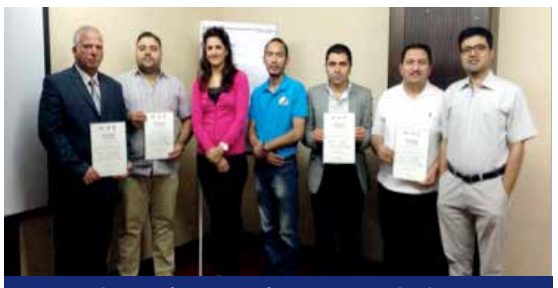
The Colombo Plan staff with their implementation partners in Iraq

With funding from the Bureau for International Narcotics Law Enforcement Affairs (INL), U.S Department of State, the Colombo Plan Drug Advisory Programme organized a training cum meeting for ODIC implementing partners for the city of Erbil and Baghdad, Iraq. The 5-days training cunducted from November 10<sup>th</sup> - 14<sup>th</sup>, 2014, in Dubai, United Arab Emirates, provided a working foundations utilizing the universal treatment curricula on community outreach, physiology and pharmacology