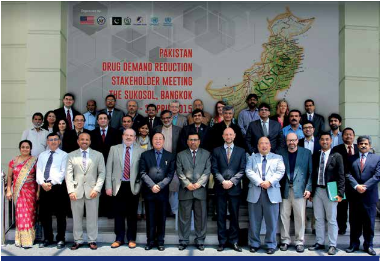
Participants of the first Pakistan Drug Demand Reduction Stakeholder Meeting

Pakistan Drug Demand Reduction Stakeholder Meeting -Bangkok, Thailand 2<sup>nd</sup> - 3<sup>rd</sup> April, 2015