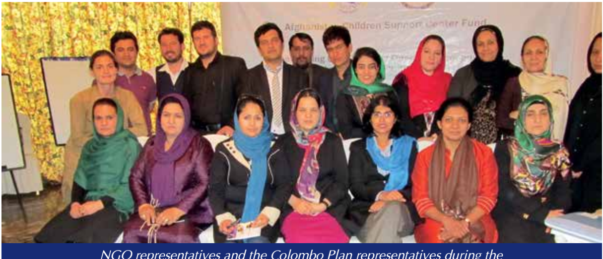
NGO representatives and the Colombo Plan representatives during the CSC stakeholder meeting in May 2015

In Afghanistan, most children affected by the conflict have limited access to education, adequate food, clean water and protection. In particular, children who live with their mothers in prison do not have access to many fundamental rights. According to the law in Afghanistan children up to age of seven years are allowed to live with their parents in the prisons. However, prison conditions are not conducive to raising children and to address the gap caused by the lack of government action, Children Support Centers (CSCs) were set up to provide alternative care for this vulnerable population.