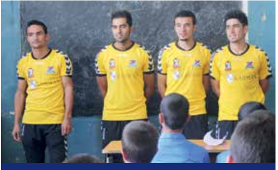
Afghan Premier League Players delivering anti drug messages at Kabul Naderya high school

A national football competition with anti drug message was carried out successfully under this project, which promoted wide awareness among, especially the youths in Afghanistan