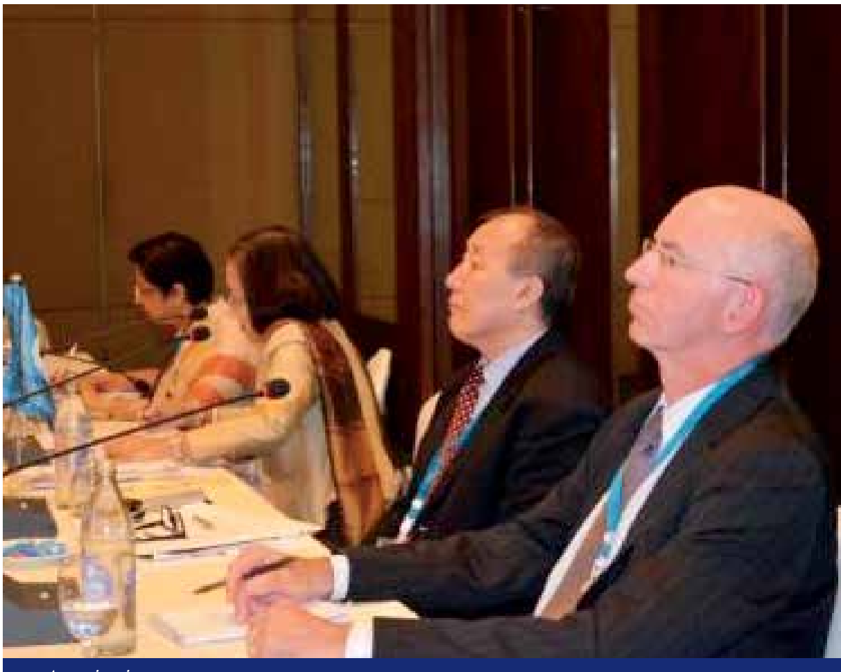
A session in progress

The 3<sup>rd</sup> Drug Focal Points Meeting of the Colombo Plan Drug Advisory Programme (CPDAP) was held in Chiang Mai from 3-5 September, with a stress on 'strengthening networking and collaborations' as an effective way to fight drug use in the region.