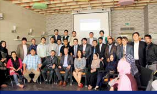
Master Trainers participating in Universal Prevention Curriculum Training in Dubai

An Advanced training programme for the Master Trainers carried out in Dubai with international trainers training 26 teachers on Universal Prevention Curriculum.